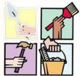
Building & Grounds Ministry

Add to this the usual maintenance issues like roofing repairs, drain maintenance, grounds maintenance, snow removal, painting, etc. and you can see that, although you may not have been here to see it, the Trustees have been busy. We hope you will soon return to in-person worship and take advantage of the wonderful facilities we are privileged to have here at Grace Church.